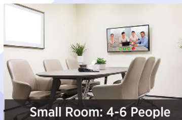
Small Room: 4-6 People