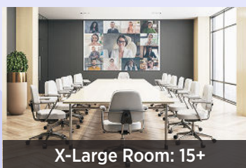
X-Large Room: 15+