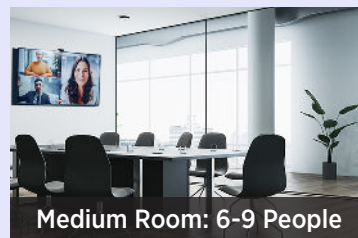
Medium Room: 6-9 People