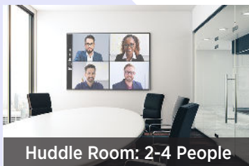
Huddle Room: 2-4 People

Teams Rooms is designed to improve Teams meetings in different spaces, from small huddle rooms to large conference rooms, focusing on inclusivity and a user-friendly collaboration experience. This ecosystem of connected devices, combined with the Teams app, transforms any meeting room into an inclusive and accessible collaboration space, ensuring active participation from participants regardless of their location.